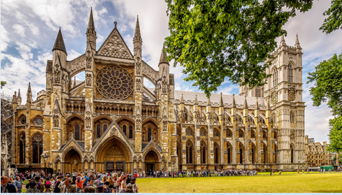
Westminster Abbey.

Westminster is home to many of London's most iconic attractions, such as the Houses of Parliament and Big Ben.